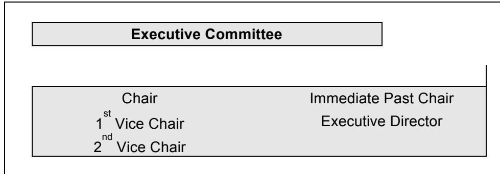
CHART OF ORGANIZATION

General Powers: The Executive Committee shall possess and exercise all powers of the Board of Trustees during the intervals between meetings of the Board of Trustees.